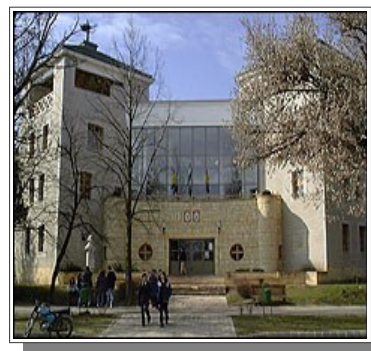
Tokaji Ferenc High School

In the case of a private hotel reservation, the conference fee will be reduced to 120 EUR for participants and 80 EUR for accompanying persons covering everything except accommodation.