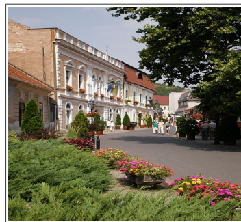
A street in the Old Town

Tokaj is a historical town in Borsod-Abaúj-Zemplén county , Northern Hungary, 54 kilometers from county capital Miskolc. It is the centre of the famous Tokaj-Hegyalja wine district where the world famous Tokaji wine is produced.