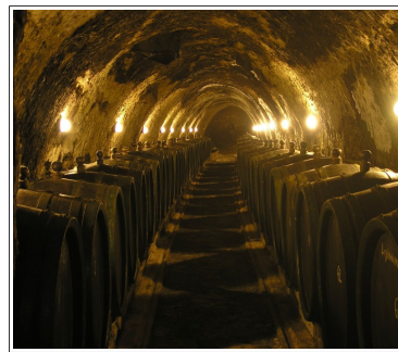
A wine cellar

In the first years of the 18th century, the Transylvanian Prince Ferenc Rákóczi II (1676-1735) recognised the unique quality of Aszú wine and used the proceeds from Tokaji wine sales to finance his battle against Austrian domination of Hungary. In 1703, in the hope of cultivating an alliance with France, Rákóczi gave King Louis XIV some Tokaji wine from his Tokaj estates as a gift. This was served at the French Royal court at Versailles, where it became known as Tokay. Delighted with the precious beverage, Louis XV of France offered a glass of Tokaji to Madame de Pompadour, referring to it as "Vinum Regum, Rex Vinorum" ("Wine of Kings, King of Wines"). This famous line is used to this day in the marketing of Tokaji wines .