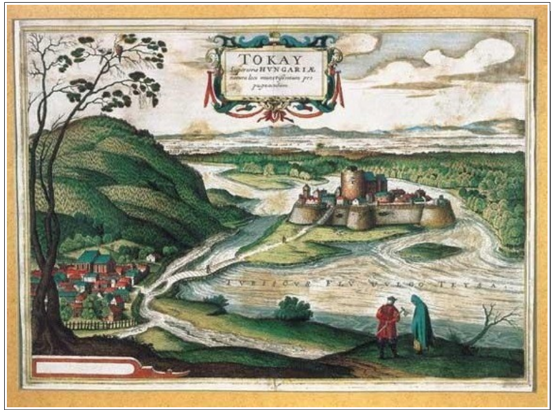
A view of Tokaj in 1658