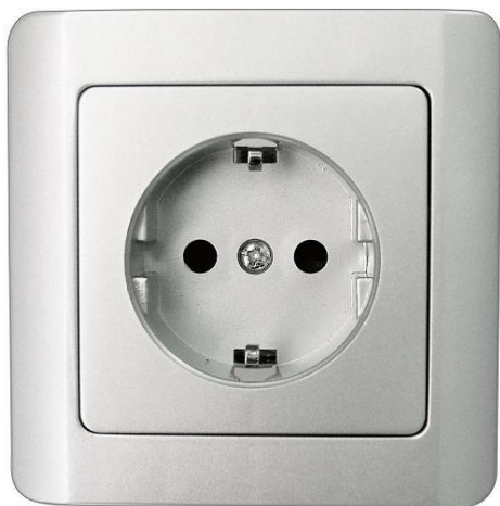
Standard continental power socket

Make sure that you have the converter for the plugs. It is rather costly to buy a converter in Miskolc.