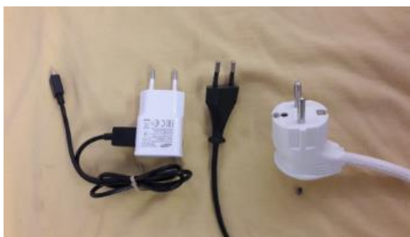
Standard continental plugs

You can invite guests to your room provided that they are registered by the doorman beforehand and that you have the permission of the deputy-director. Please be prepared that certain extra fee is to be paid for your guest. The Guest Registration Form is available at the Student Hostel. (If there is a vacant bed in the room and the other roommates assent to it in advance, then you get the permission. Without a permission, every guest (who lives in another hostel or outside) must leave the building until 11:00 o'clock p.m.)