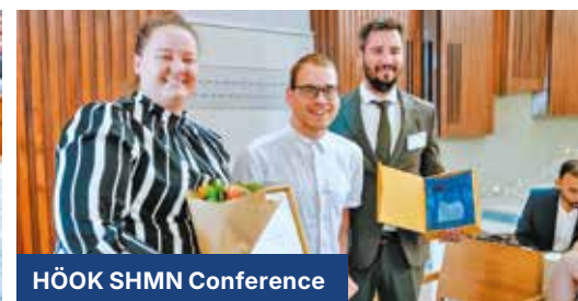
HÖÖK SHMN Conference